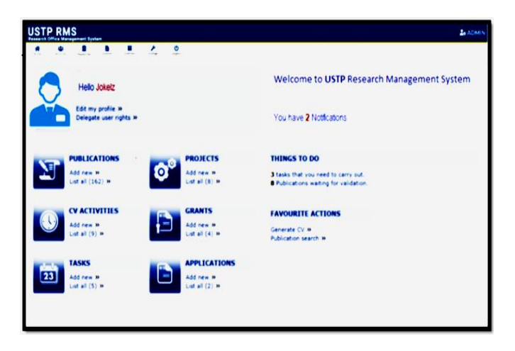
Figure 3: Research Director Landing Page Draft Prototype

Based on the identified user requirements, the researchers were able to design graphical user interfaces (GUIs) or system prototypes which were shown to the users for feedback and suggestions. This phase was iterative and used the rapid prototyping technique in creating several prototypes that were presented to the users reflecting their suggestions then confirming with the users and getting feedbacks again until a finalized prototype was recognized. Shown in Figure 3 was a draft prototype design for the user Research Director (RD) Landing Page. This was shown to the user for feedback and Figure 4 was a rapid prototype design integrating the user feedback for an RD landing page. It included a communication section where RD can post announcements such as a call for proposal, send notification and message to specific user groups.