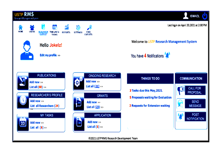
Figure 4: Research Director Landing Page Prototype Reflecting User Feedback.

Figure 3: Research Director Landing Page Draft Prototype